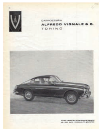
Left: King Baudouin of Belgium Above: The finished car, delivered in 1955