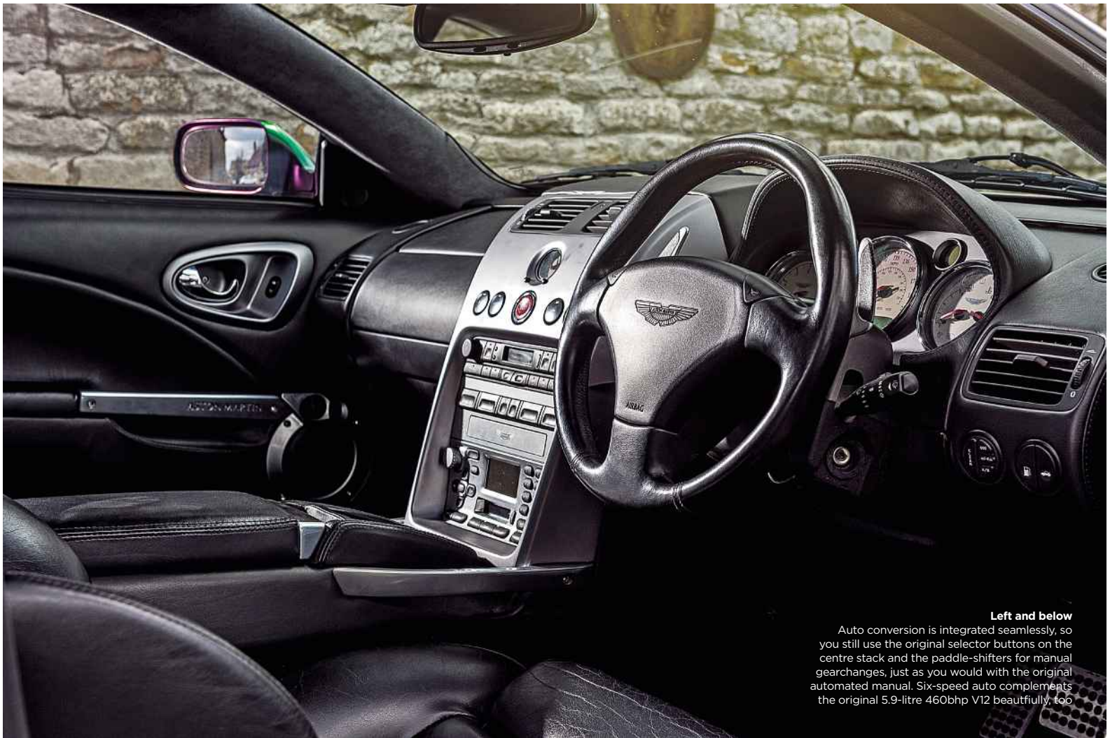
Left and below Auto conversion is integrated seamlessly, so you still use the original selector buttons on the centre stack and the paddle-shifters for manual gearchanges, just as you would with the original automated manual. Six-speed auto complements the original 5.9-litre 460bhp V12 beautifully, too.