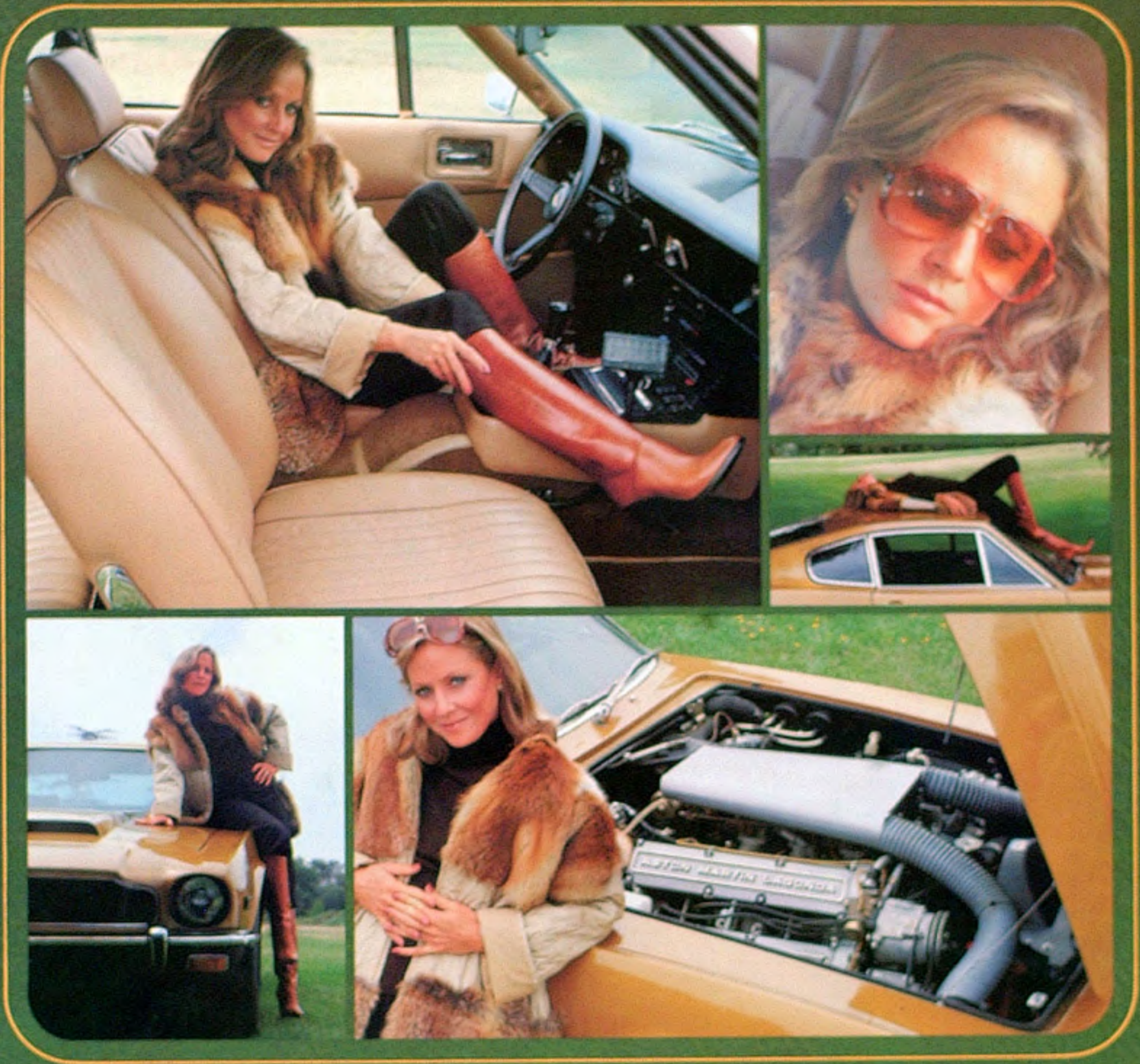
Aston Martin V-8